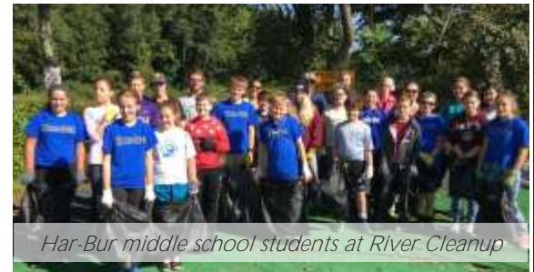
Har-Bur middle school students at River Cleanup

Community Involvement in 2018 Youth Program Attendees: 389 Total value of volunteer time: approx. $34,800