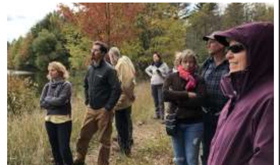
Saville Dam & Barkhamsted Hollow Tour