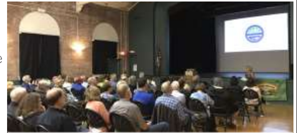
Wild & Scenic Film Festival in Collinsville

And for all those that volunteer their time, there are many more who contribute financially to us and have been loyally supporting us for ten, twenty, thirty years or more. And for that we are THANKFUL!