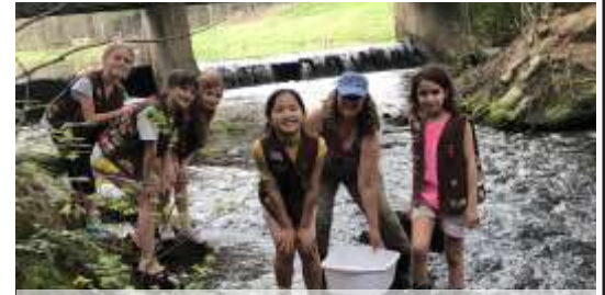
“Streambugs” fieldtrip in Stratton Brook

Celebrating our Wild & Scenic River. This year we celebrated 50 years of the Wild & Scenic rivers Act with additional programming including a film festival, author talks, Farmington River Quilt exposition. We also celebrated our third year as the sponsoring organization to the Jamie McEwan Tariffville Triple Crown Canoe & Kayak Races.