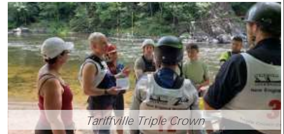
Tariffville Triple Crown