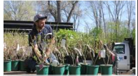
Volunteers planting at Buffer Project